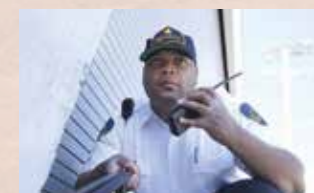
Gate and security guards