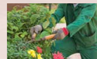
Ground keeping/ gardening/landscaping