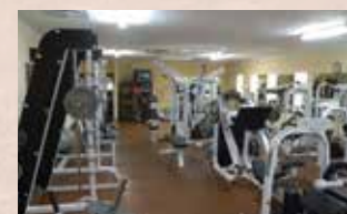
Satellite TV and recreational services including gym