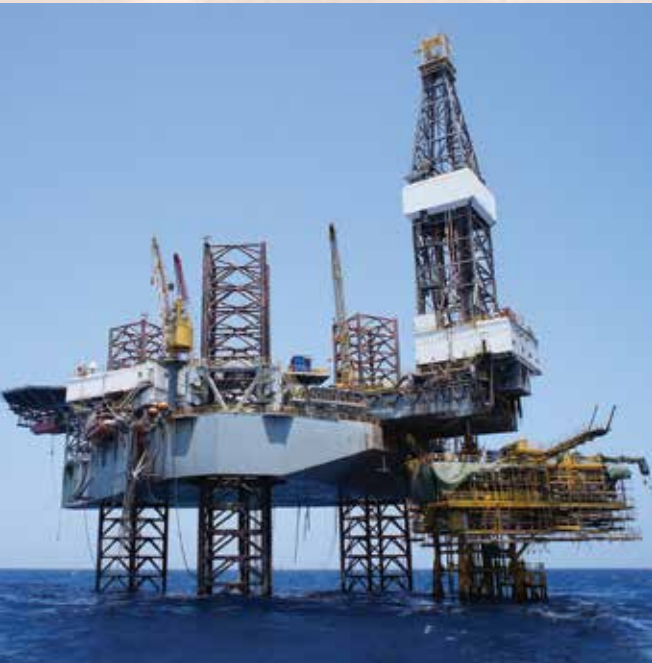
Oil and Gas Rigs