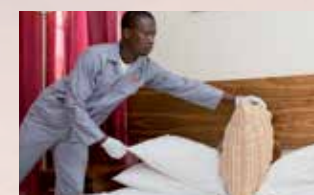
Housekeeping and cleaning