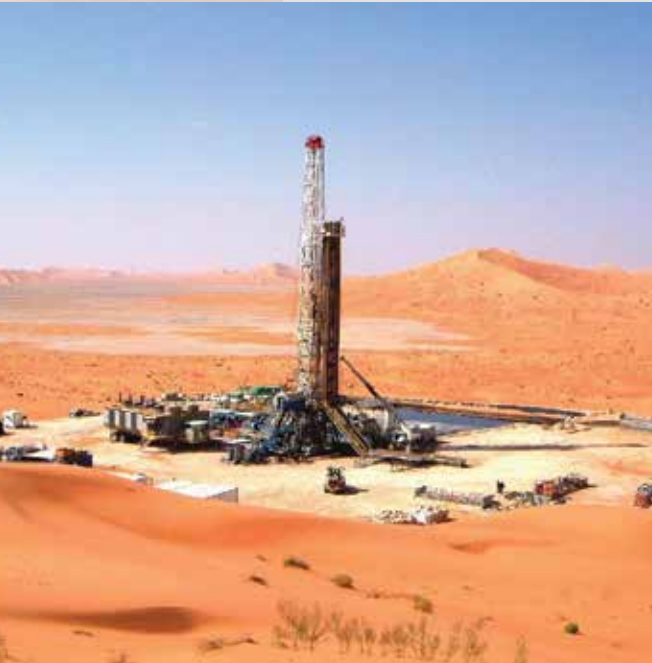
Gas and Oil Exploration