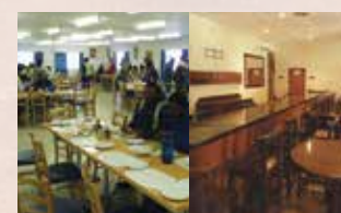
Bar/tuck shop service