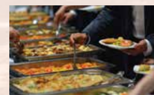
Functions and events catering service