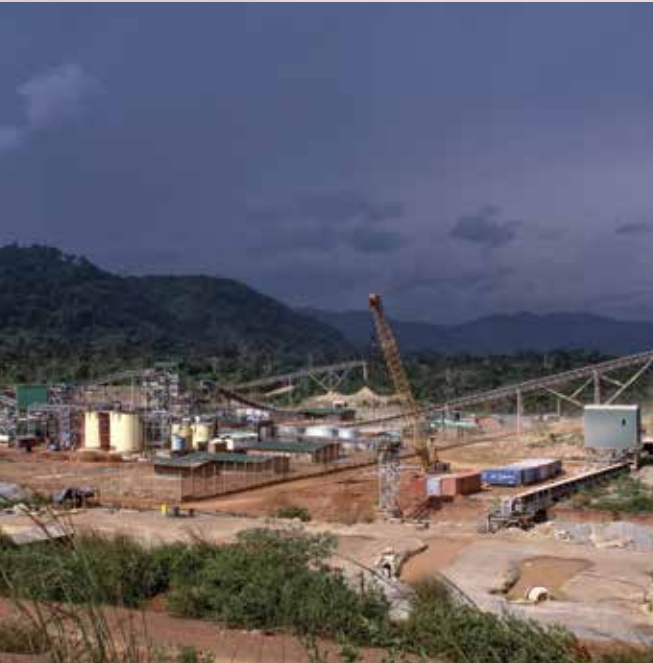
Exploration and Mining

Over 10 years experience delivering intergrated, full life support solutions to drilling rigs up to 60km offshore. Clients include multinational drillers.