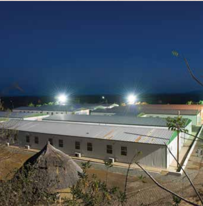
Commercial and Industrial