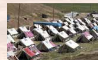
Temporary tent sites