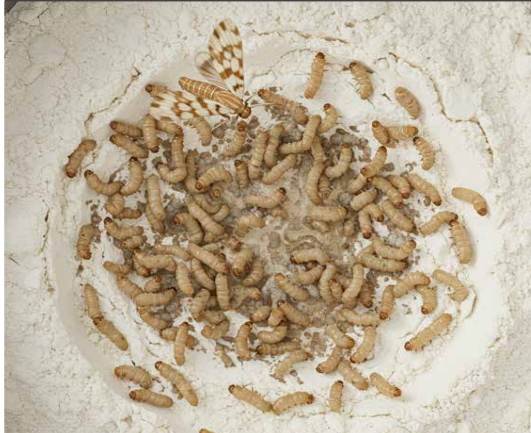
Indian meal moths