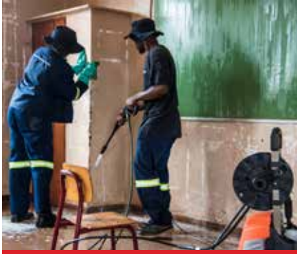
Elevated Hygiene Services