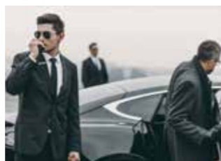
Risk Management, e.g. Close Protection Officers