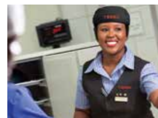
Catering Solutions for Essential Services, e.g. Healthcare Facilities, Quarantine Centres and Medical Staff Accommodation

We continue to implement our Good Manufacturing Practices and high Food Safety Standards by providing catering and vending services to our essential services customers. Our team of registered dietitians continuously adapt our customer menus to ensure the right balance of nutrients to support the immune function.