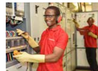
Engineering, Energy and Maintenance Services