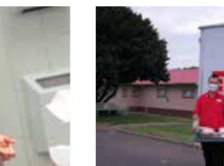
Delivery of Emergency Meals and Groceries to the Elderly and Other Vulnerable Communities