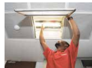
Facilities Management Solutions for Essential Services, e.g. Hospitals and Banks

Tsebo Facilities Solutions continues to support our customers, from enhanced Engineering, Energy and Maintenance to Facilities Management for essential services customers, and basic maintenance for customer sites that are closed as required. We provide a fully consultative process, bringing together the experience of our facilities, engineering, catering, cleaning, procurement, security and energy divisions to define and deliver tailor-made remote site/camp solutions.