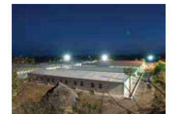
Remote Site/Camp Solutions