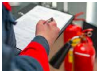
Other Specialised Services, e.g. Risk Consulting and Fire Management