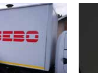
Vending and Beverage Solutions Support for Essential Services