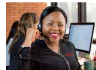
Remote Monitoring and Call Center Management