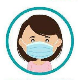
MOUTH, NOSE AND CHIN, with the coloured side facing outwards.