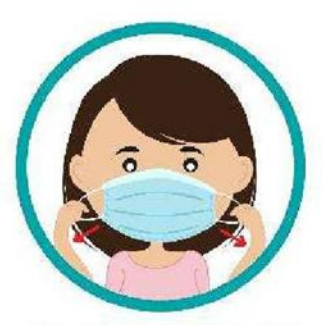
Remove a used mask by HOLDING ONLY THE EAR LOOPS .