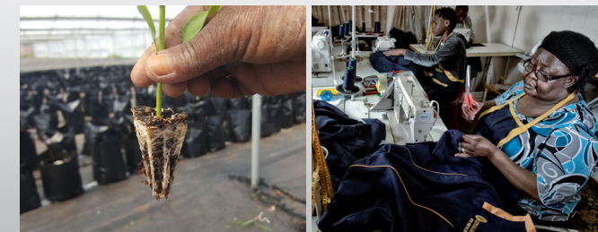
Siyakhula Initiative Sustainable enterprise creation and community involvement