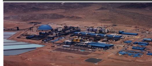
Mining: We run an entire town in the middle of the desert