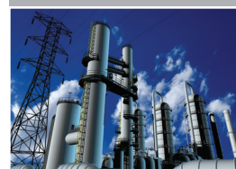
Power Station: 20,000 meals served every day

Where drops in efficiency have massive implications