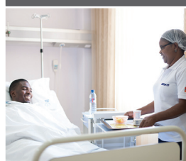
Largest PP Hospital in Africa