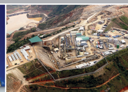
Mining: 3 days drive from established infrastructure

We measure ourselves against our clients' metrics