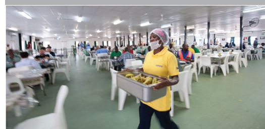
Large Vehicle Plant: Tailor-made processes to feed 10,00 employees and get them back on the line in 20 minutes

We measure ourselves against our clients' metrics